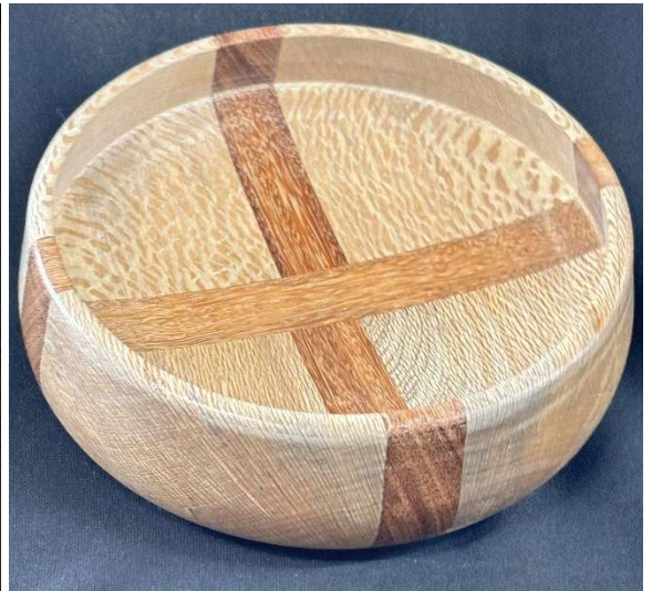
Above left: Platter . Suzanne Ings (2026) . Poplar burl ( Populus sp. ).