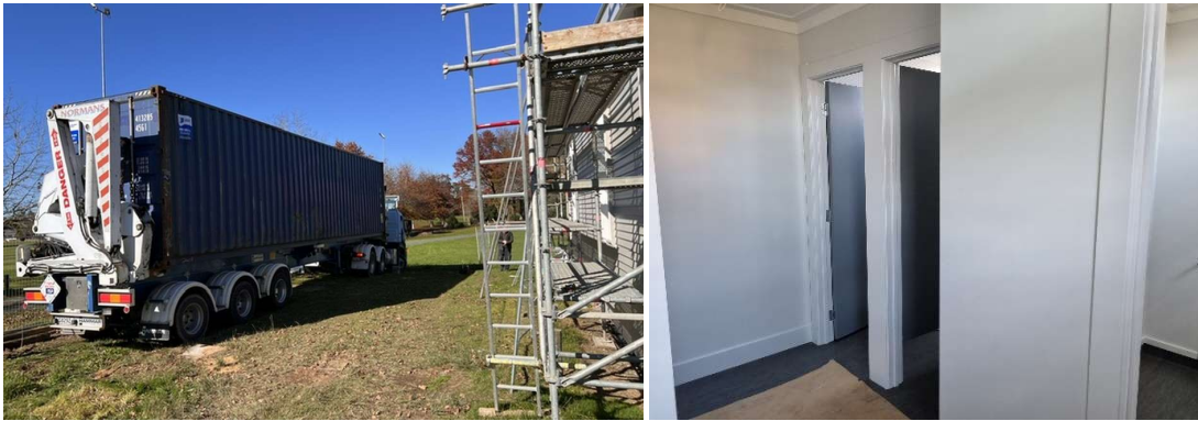
Above left: Shipping container arriving at Cambridge Road.

On the financial front, we have received a $150,000 grant from the Lottery Grants Board as well as a $10,000 grant from WEL Energy Trust . These latest grants give us much more certainty around our spending and timelines, and we are looking on track to complete and move in as expected later this year.