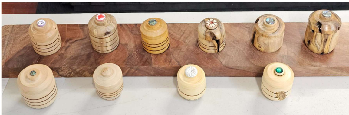
Above top: 3D Illusion Vase. Stephen O'Connor. Kwila ( Intsia sp. ), oak ( Quercus sp. ), walnut ( Juglans sp. ), ash ( Fraxinus sp. ), macrocarpa ( Cupressus macrocarpa ) and blackwood ( Acacia melanoxylon ) base. Above bottom: Turned Set. Peter Watt. Various timbers including Lemon ( Citrus limon ), Gorse ( Ulex europaeus ) and Walnut ( Juglans sp. ), with embellishments.